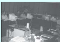
Hands on Session

Email: info@cepm.com , adesh@cepm.com Visit our web site: www.cepm.com