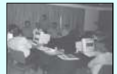
Hands on Session